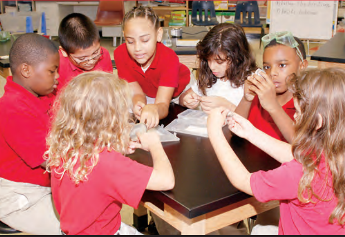
Uniforms: Students at R.L. Brown Elementary wear uniforms of red or white shirts with navy blue or khaki skirts, shorts or pants.

Richard L. Brown Elementary School is committed to creating a community of lifelong learners and socially responsible global citizens by developing hearts and minds. Named an International Baccalaureate School in September 2008, R.L. Brown is the first Duval County elementary school to receive such certification.